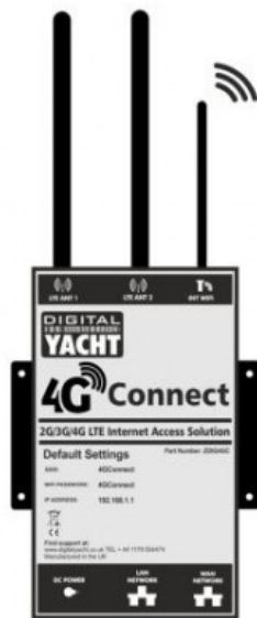
4GConnect Standard System