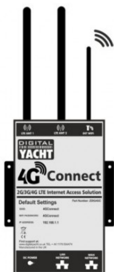
4GConnect Standard System